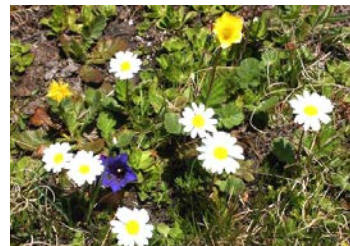
Alpen-Margerite • Leucanthemum alpina

Scendendo sul muro dell'elevatore a secchi d'acqua, che qui ci ricorda in qualche modo il grande muro cinese, arriviamo al punto di informazione n. 34 fra la zona centrale di lavorazione in superficie (a destra) e la gigantesca conca della zona inferiore di lavorazione in superficie (in basso a sinistra). Con la costruzione dell'elevatore ed a causa della lavorazione distruttiva in superficie (forse anche a causa di un'alluvione devastante) in questa zona sono sparite diverse gallerie: in basso a sinistra nei dintorni della